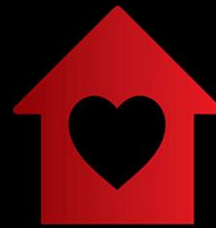
blessings of community