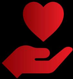
grace & generosity