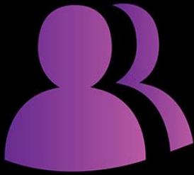
worth of all persons